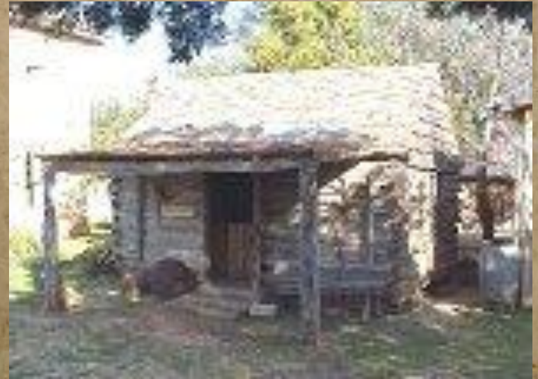
Cabin built in 1875