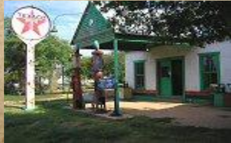
Texaco Service Station, 1926