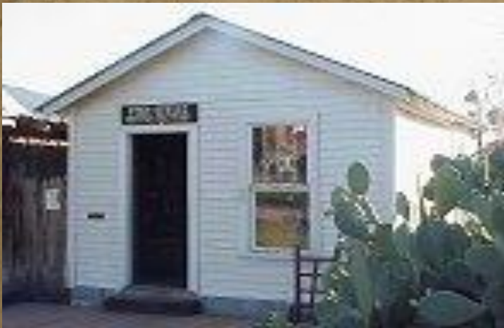
Post Office, 1950