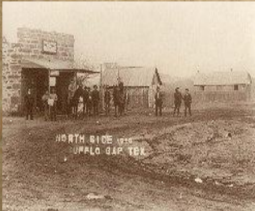
Downtown Buffalo Gap, Texas in 1910