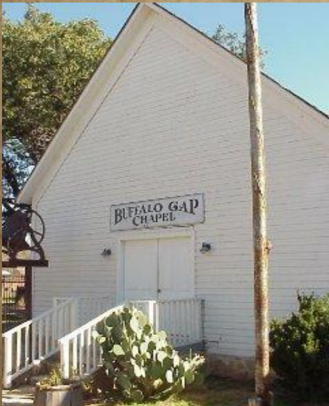
First Church of the Nazarene Formed in 1898