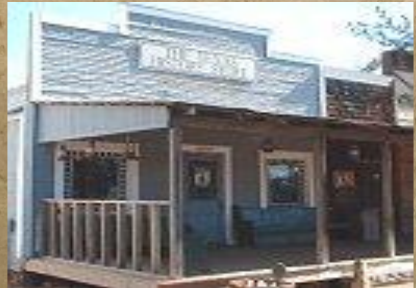
Buffalo Gap Historic Village