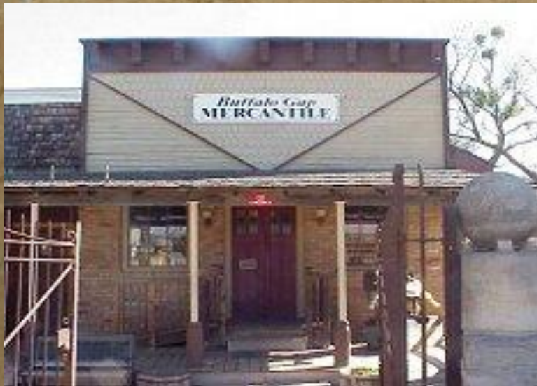
Buffalo Gap Mercantile, 1910