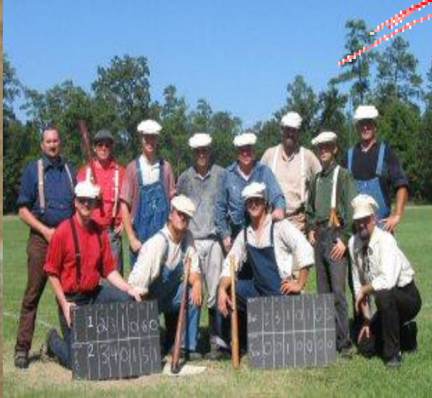
Vintage Base Ball