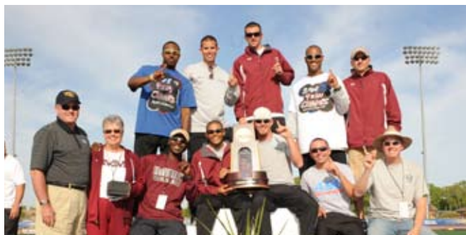
2008 National Outdoor Men's Track and Field Champions