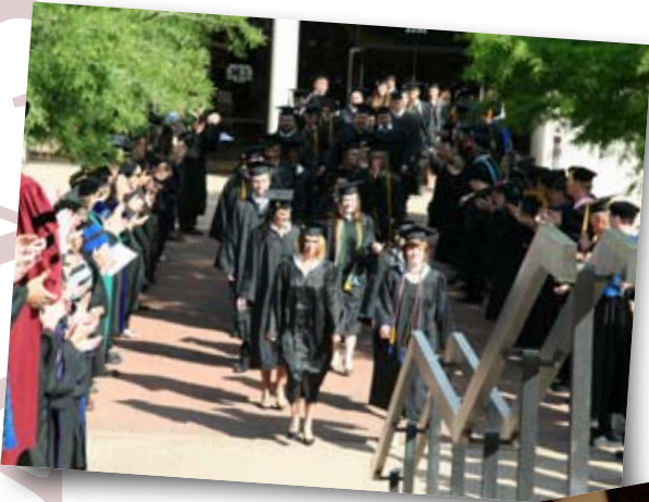
The Class of 2008 processes through the line of faculty and staff on their way to their Spring Commencement Ceremony on May 10, 2008. ▲