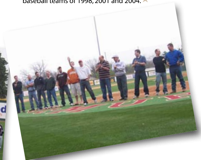
Members of the 1998 ASC Championship Baseball team were one of three teams recognized during the "Weekend of Champions" that was held March 28-29, 2008. ▲